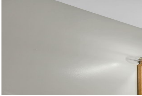
615 South Alton Way #3D, Garage parking lot 15, garage 161, Denver, CO 80247 - main level